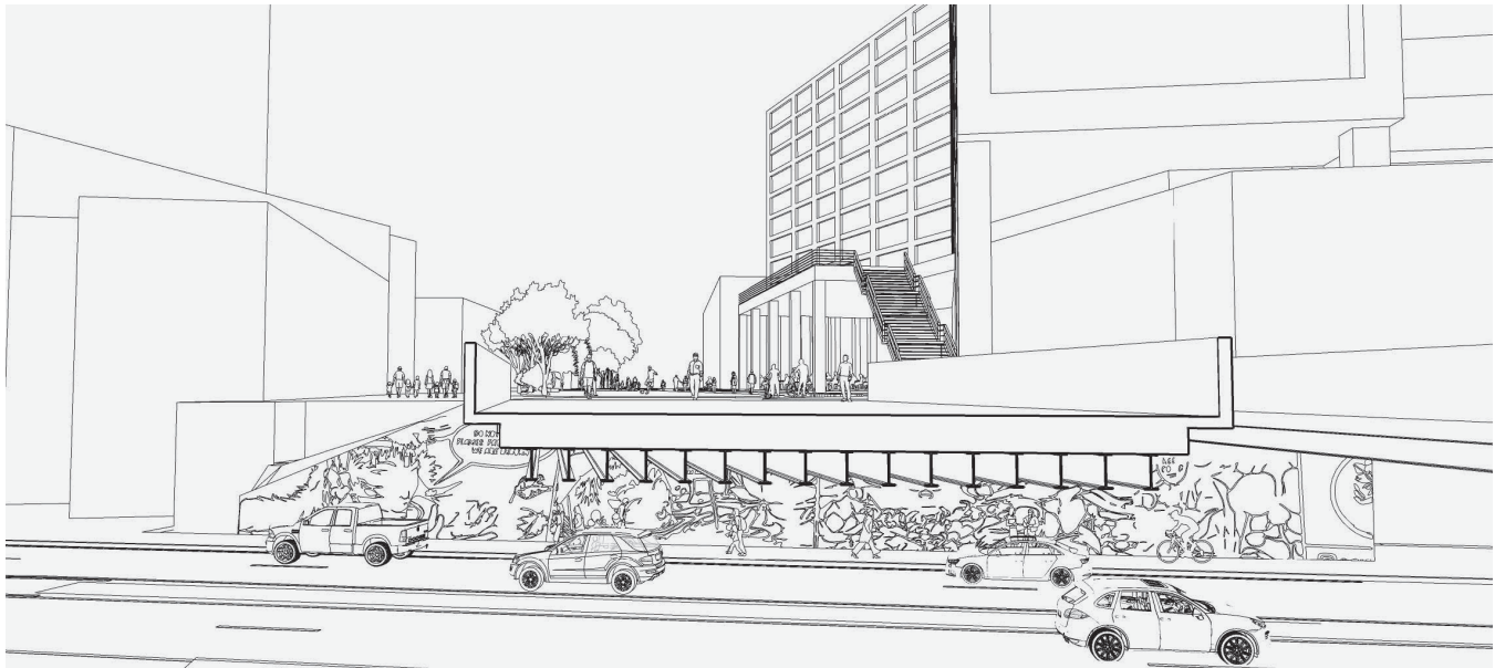
Figure 1. Image caption . Image credit.

When communities prioritize and construct well-functioning social infrastructure it contributes to overall health and well-being, better economic opportunities, lower crime rates, and more sustainable places. Despite these benefits, projects of this type are often neglected financially, partly because assets of this type do not correlate directly to sufficient revenues like critical infrastructure typically does. Because of this, social infrastructure is often under-valued and under-funded. Additionally, existing social infrastructure often requires significant improvements to meet the needs of the people who utilize it. For example, currently 53% of schools, (especially in disadvantaged communities), require improvements to reach “good” condition.