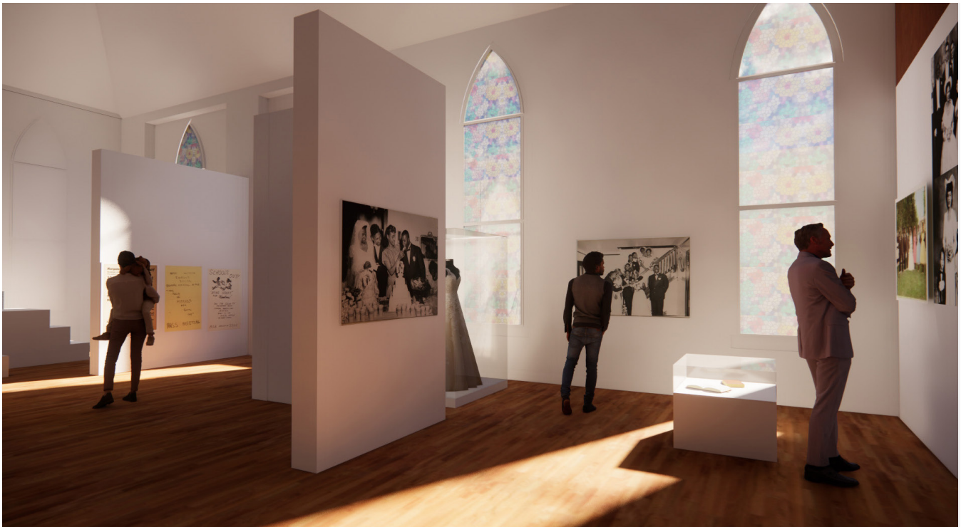
Figure 2. Mount Zion AME Zion Museum. Hettiaratchi and K. Carnes.

becomes disused and is converted to social infrastructure at the end of its functional life. A second scenario involves modifications of existing infrastructure. In this case the original critical infrastructure is still in use and remains so in its new form. Social infrastructure within this reconsidered scenario is added to existing projects without compromising their function as the original work's value makes it too important to decommission. Lastly, designers can weave social and critical infrastructure together from a project's conception. All these scenarios produce a finished project that helps society function while promoting social interaction.