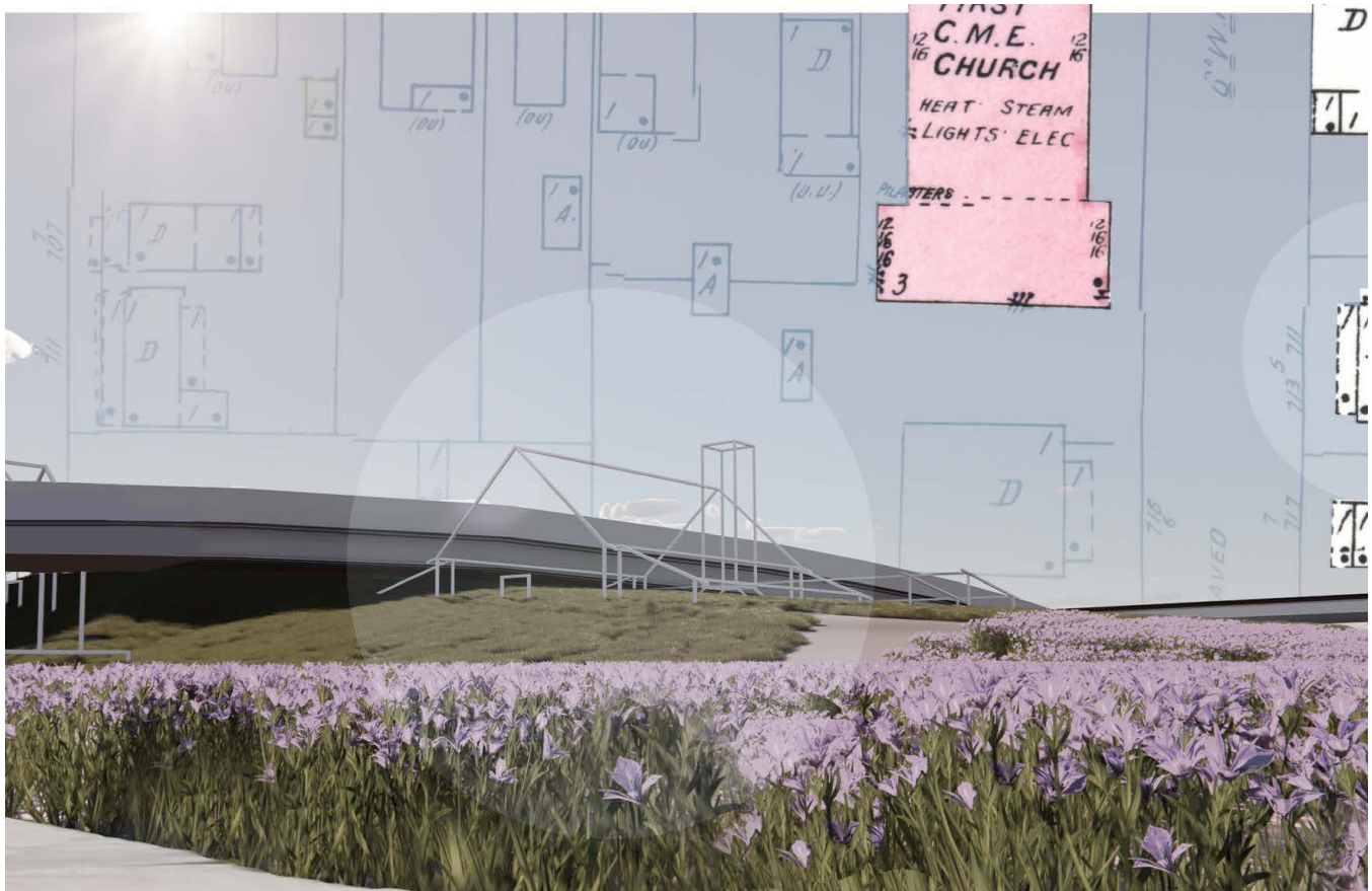
Figure 3. Mapping Reverence , Hollen Terry

required to describe a narrative about the place. Many of the drawings presented ideas about the history of the place with emphasis placed on the influence of the interstate. Both projects provided an opportunity to understand the neighborhood on a physical and cultural level.