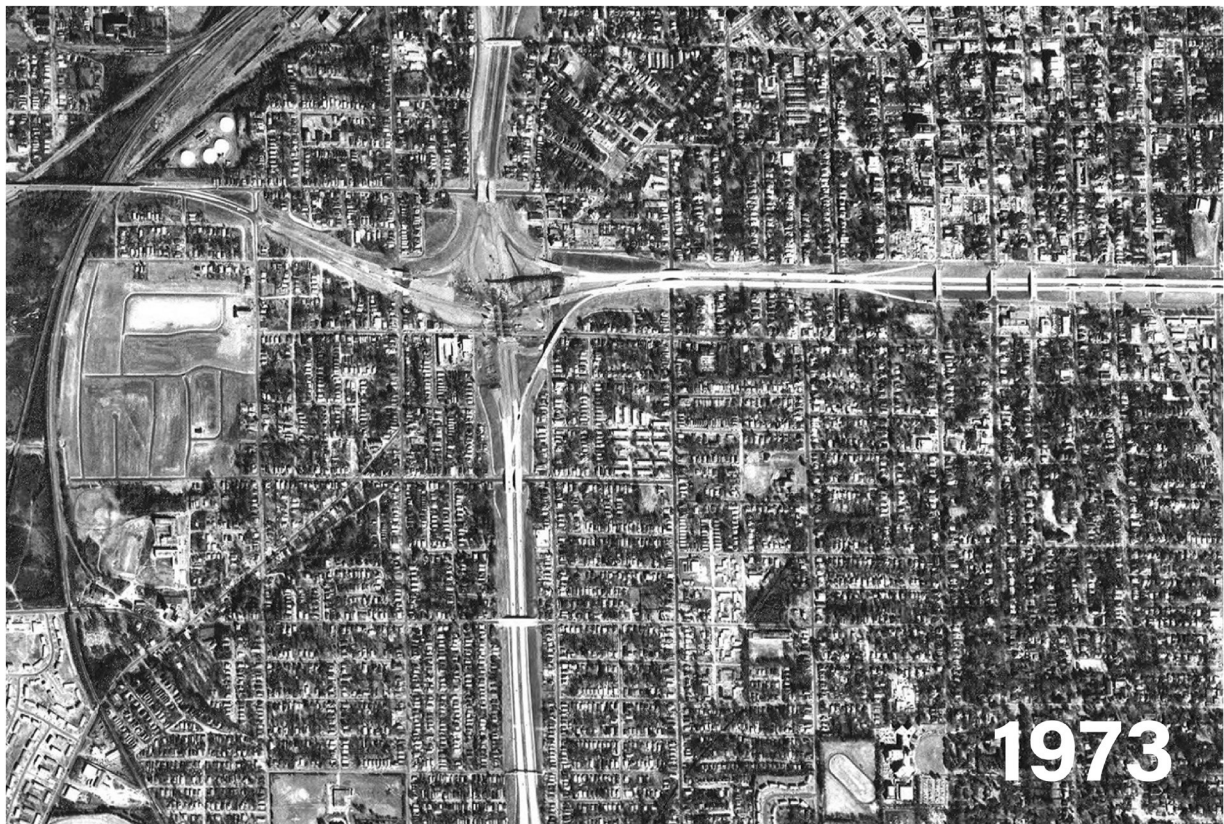
Figure 4. The Peacock Tract United States Geological Survey, Cartographic Research Laboratory, University of Alabama